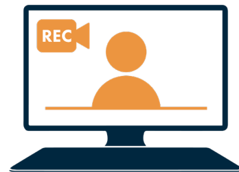
SCREEN RECORDING SOFTWARE