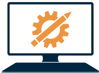
PROJECT MANAGEMENT SOFTWARE

Rapid Door & Trim uses Trainual for onboarding software and Loom for screen recording. When combined, these two pieces of technology create a way for new remote hires to shadow employees at work. Employees record their computer screens with Loom, then drop the recordings in Trainual for hires to watch at their own pace (or read through in a transcript). In this way, technology allows even remote employees to learn from peers without disturbing their workflow.