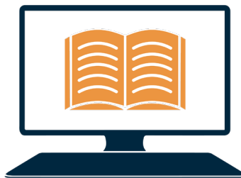
LEARNING MANAGEMENT SOFTWARE